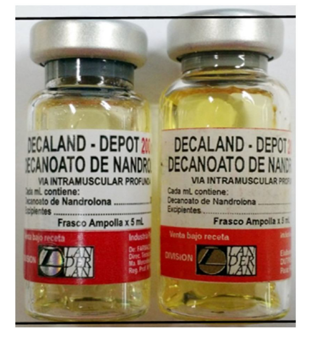
Fig. 2. Original (left) and counterfeit (right) samples of Decaland Depot<sup>48</sup>. Counterfeit flask is slightly larger, the label font is thinner and the overall label is of lower quality.

The overall counterfeiting rate detected for medicines was 42.1% (138 of 328 samples), 28.7% of tablets, 12.0% of suspensions